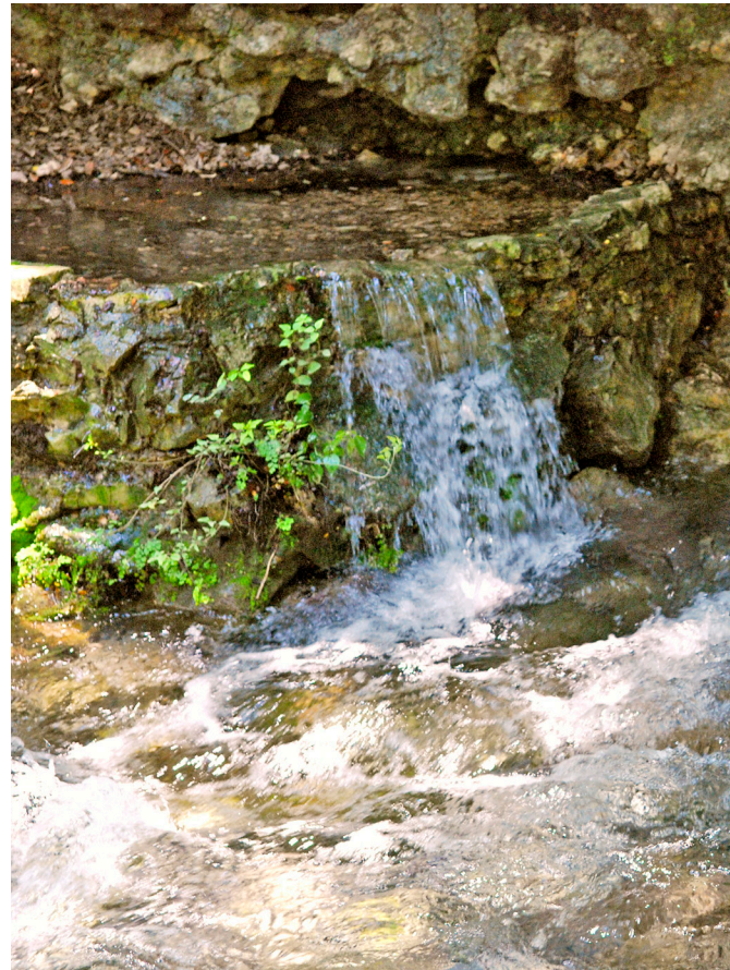
This document was developed and produced by the TGPC in fulfillment of its statutory duties. While the report represents the contribution of individual participating agencies, it does not necessarily reflect all of the views and policies of each participating agency or the Texas Environmental Protection Agency.

The plan for preserving groundwater in the state starts with the existing regulatory and non-regulatory groundwater protection, remediation, and conservation programs listed in the Joint Report . In addition, this edition of the Strategy document introduces a summary of the dynamic and interactive processes by which information is exchanged and recommendations are made within and between the TGPC, its Subcommittees, and the public in order to further protect groundwater resources in the state. The comprehensive strategy for protecting groundwater in Texas includes both the TGPC member’s internal programs and the TGPC’s internal processes outlined below.